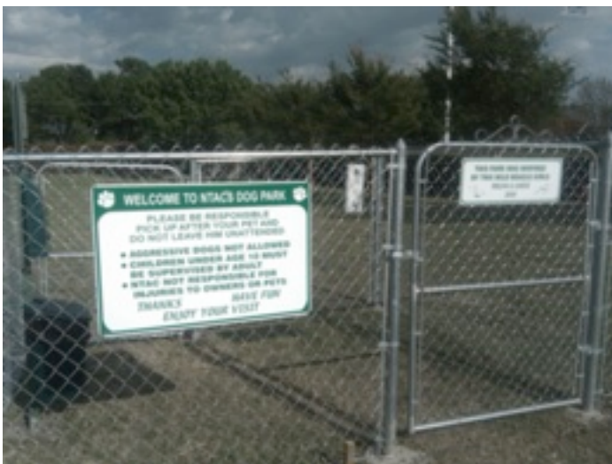
Entrance to Dog Park

Thanks to all the volunteers (you know who you are) for a great job. This goes to show that when we all pull together, we can accomplish a lot.