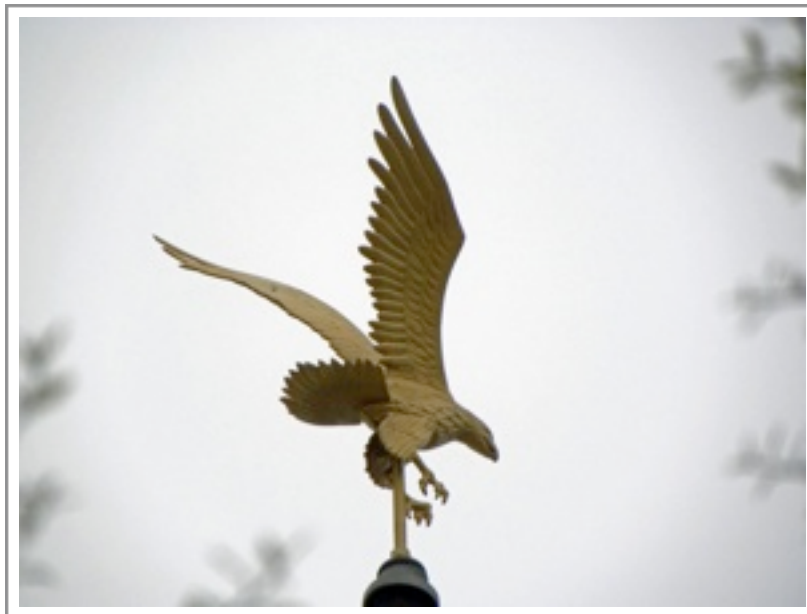
New Eagle for Flag Pole