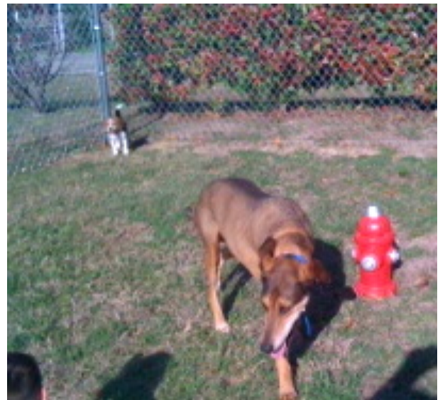
Dog Park Fire Hydrant