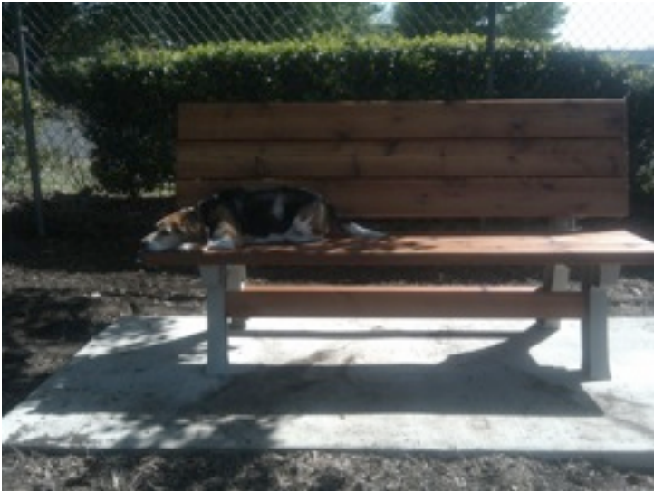
Lounging on the Park Bench