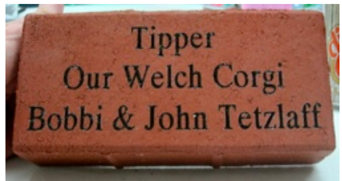
Memorial Brick Sample